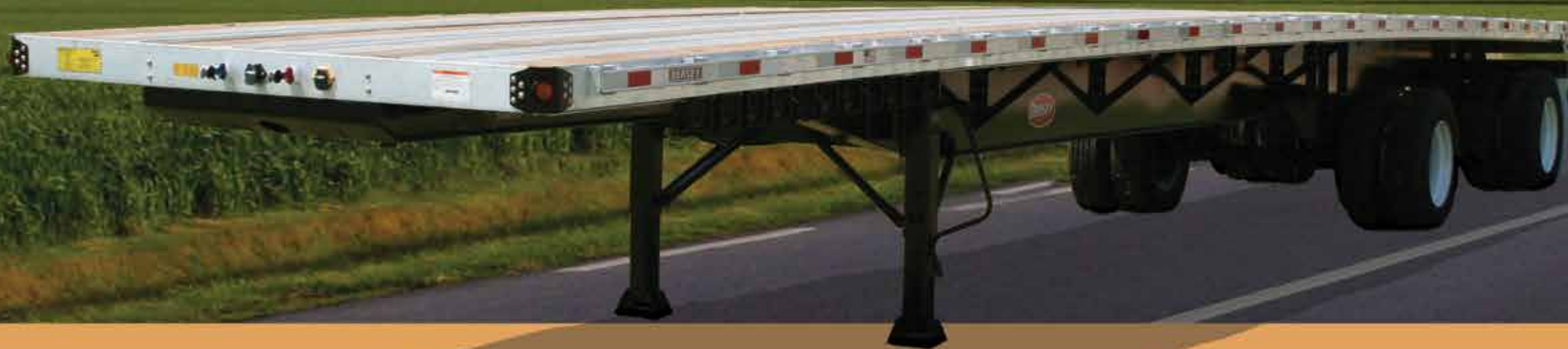
MODEL: FC - 48

Today, Dorsey's vision remains the same.