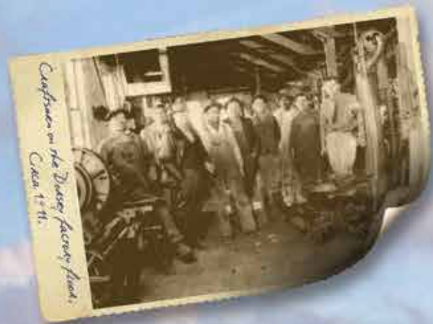
Craftsmen in the Dorsey factory, Elba, Ala. 1911.